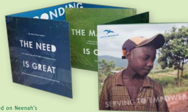
LIA brochure, printed on Neenah's Environment stock, with 100% post-consumer waste content.