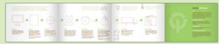
O'Neil Prints Green brochure, printed on Neenah's Environment stock, with 80% post-consumer waste content.